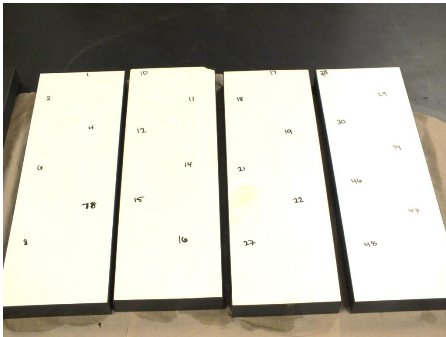
Post-exposure volatile chemicals