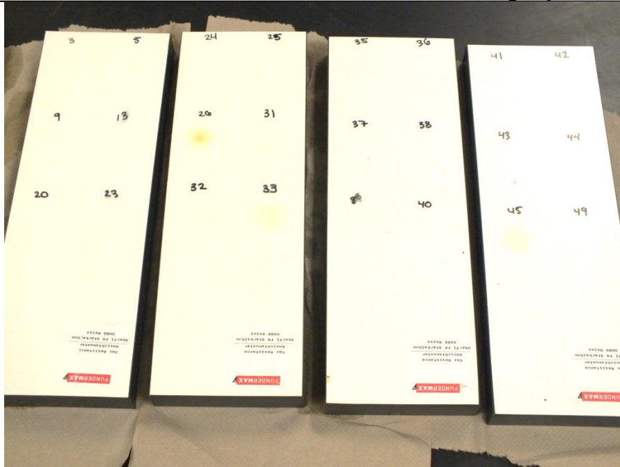
Post-exposure non-volatile chemicals