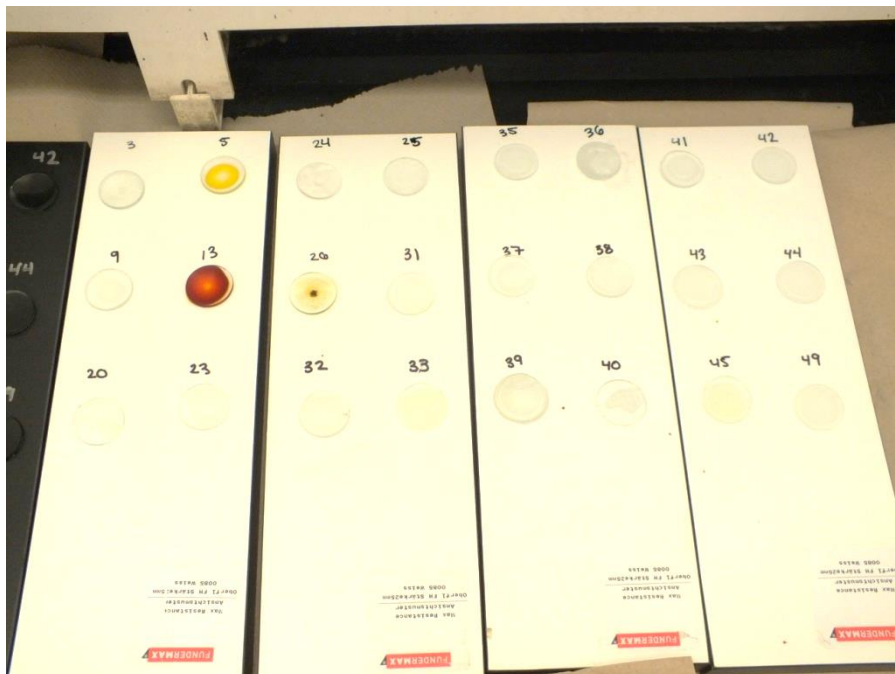
Setup non-volatile chemicals